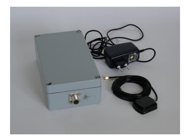
Fig. 2: Transmitter set