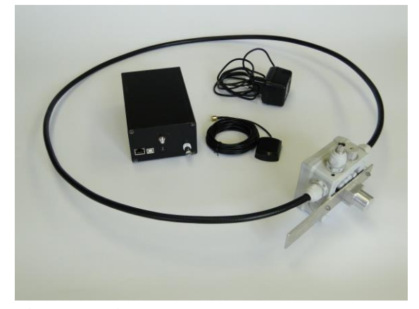
Fig. 1: Receiver set

Specific software was developed to control remotely the receiver and to perform primary data processing – visualization in the form of Doppler shift spectrograms.