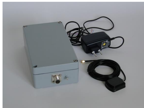
Fig. 2: Transmitter set