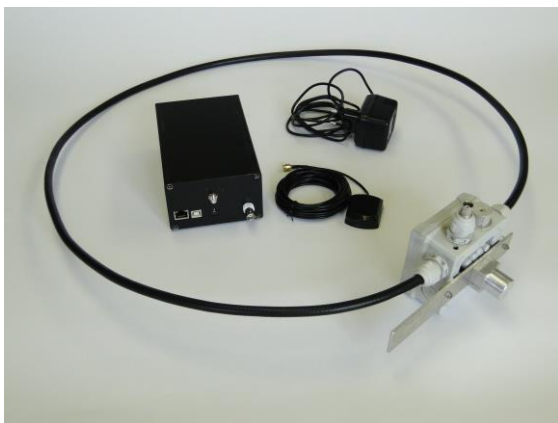
Fig. 1: Receiver set

Specific software was developed to control remotely the receiver and to perform primary data processing – visualization in the form of Doppler shift spectrograms.